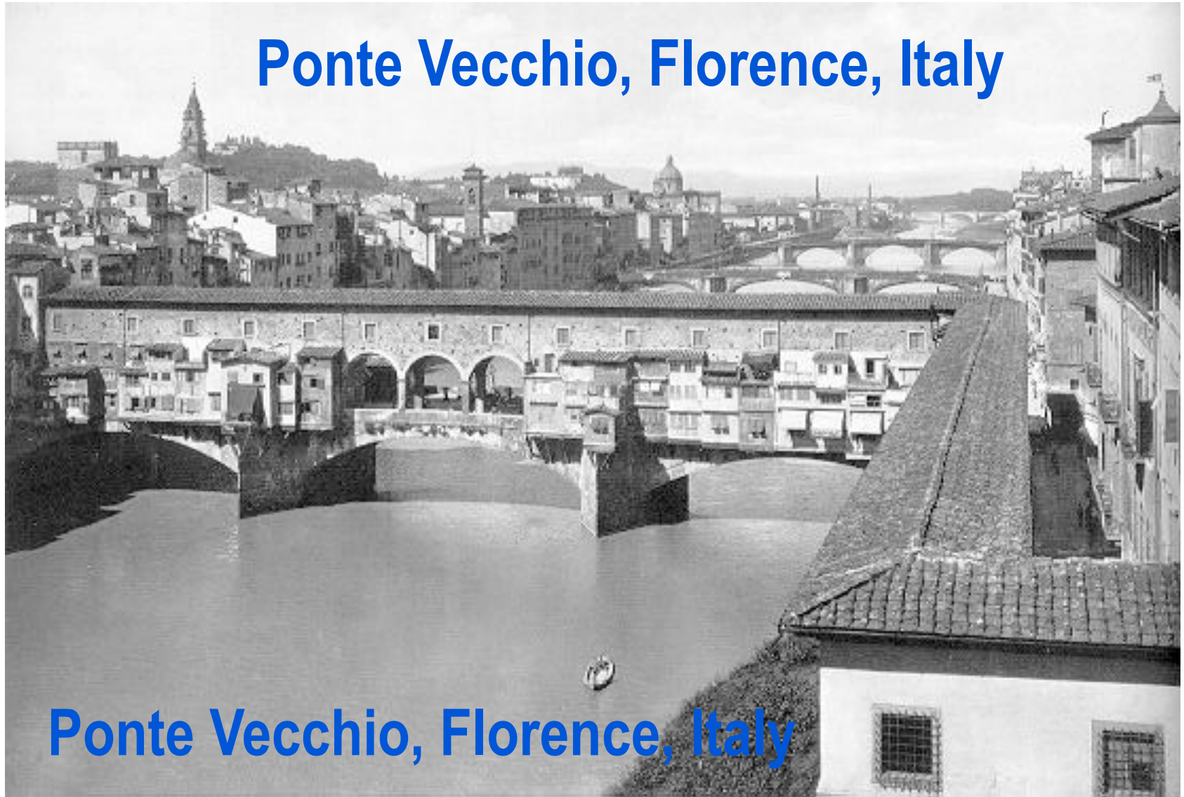
Ponte Vecchio, Florence, Italy